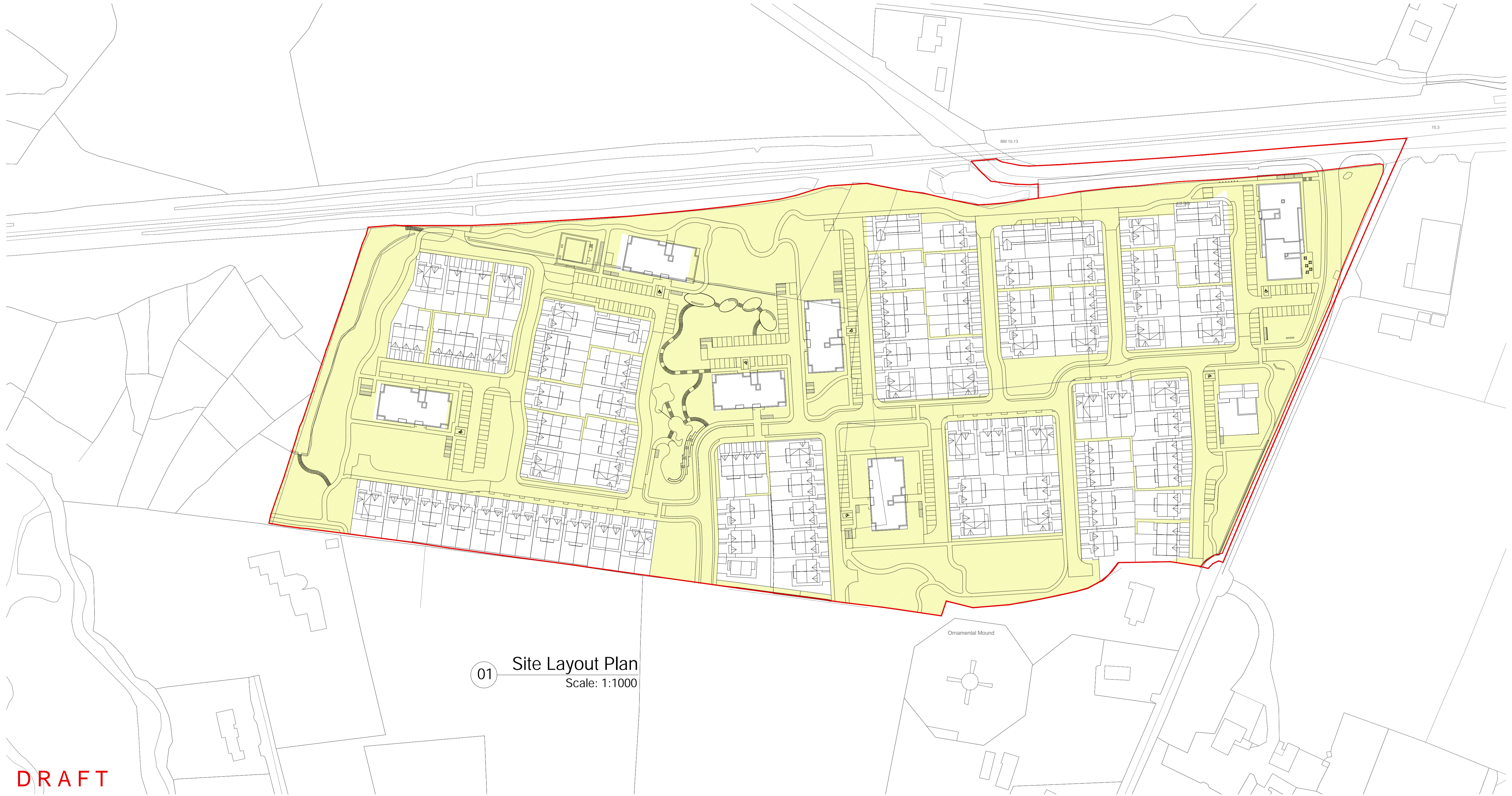
01 Site Layout Plan Scale: 1:1000